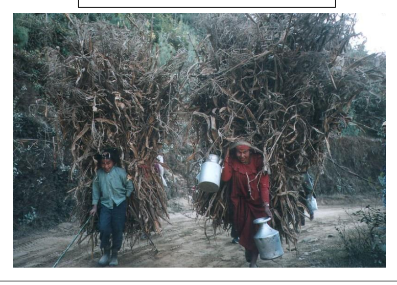
"Mountain porters (Nepal)"

Tourism brings income and economic benefits to mountain communities, but the challenge is how to manage the environmental, social and cultural impacts of that. Recreational tourism and associated infrastructure, commercial and residential development raise the question of how to prevent damage through over-activity; and particularly, how to share benefits from tourism to local populations, including indigenous peoples. Is economic growth happening in a socially and culturally appropriate and equitable way? Locations for second homes, such as in Nainitial, Uttarakhand, in India, and in Whistler, British Columbia, in Canada, put property prices and many local services beyond the means of local populations. And when land cover changes with development,