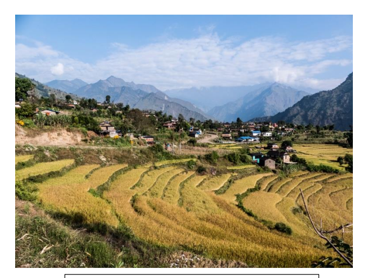
Millet farming in Nepal.

around mitigation of the impact of natural resource extraction, and the introduction of more sustainable enterprises to take its place.